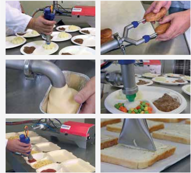
X Model with hose and gun

With this extensive and user-friendly range of BD Depositors we cover all your depositing needs and demands. These fast and powerful BD Depositing machines have been designed and developed according to today's requirements in the field of hygiene and all BD Depositors already meet the new standard of 4 bar operating pressure.