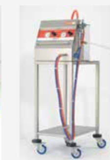
Complete with trolley and compressor