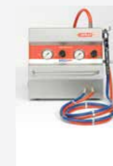
With wheeled trolley